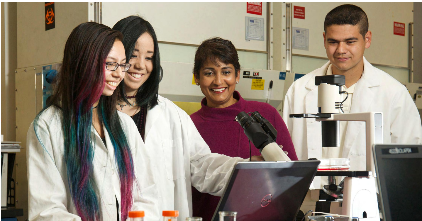
Mira Costa College