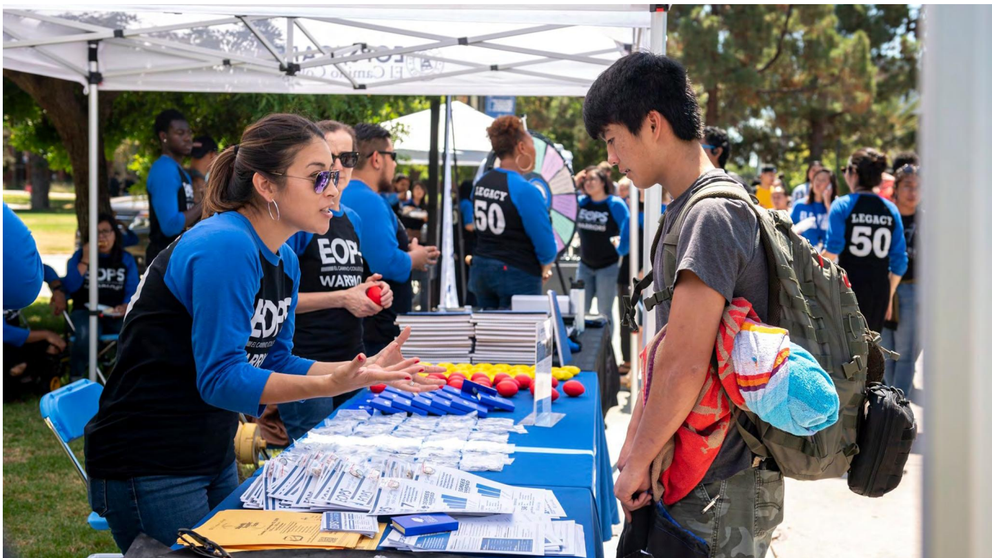
El Camino College