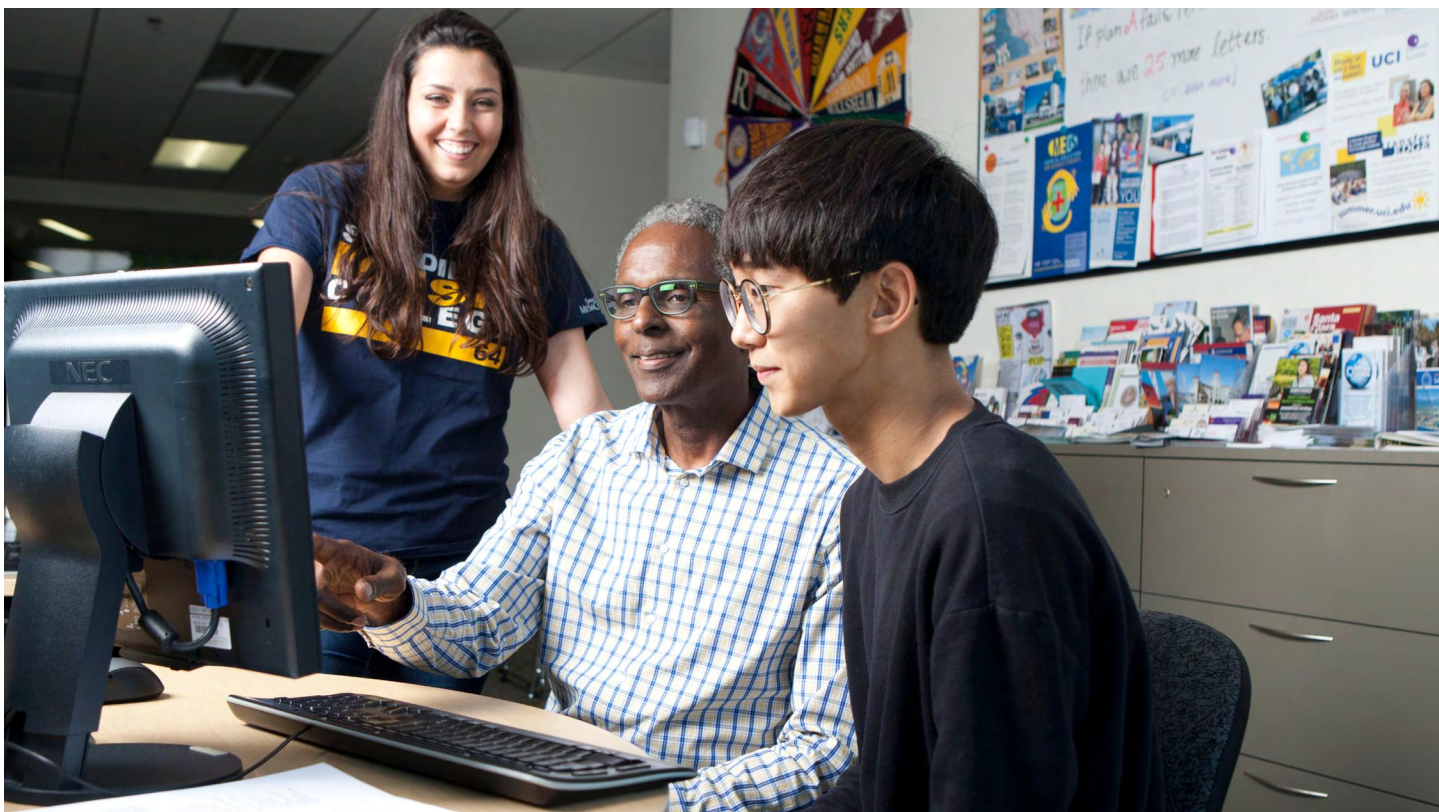
San Diego Mesa College