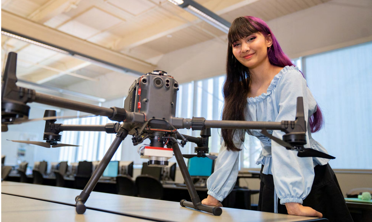
Diablo Valley College